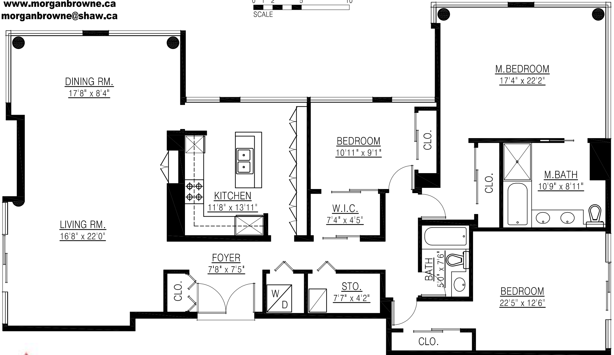
MAIN FLOOR PLAN FLOOR AREA: 1,870 sq. ft.